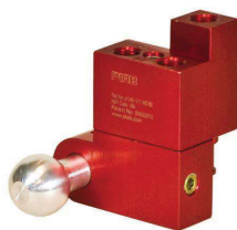
Vacuum Check Valve VT-1H with COAX®