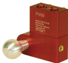
Vacuum Check Valve VT-1H